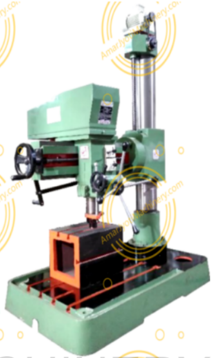
RADIAL MOTOR LIFT HEAVY