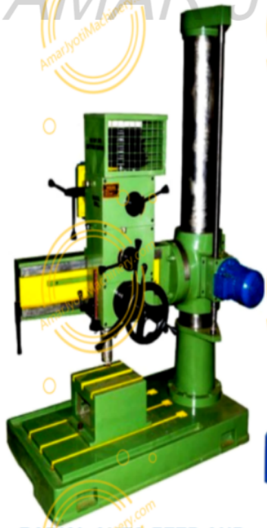
RADIAL AUTO FEED AND AUTO LIFT