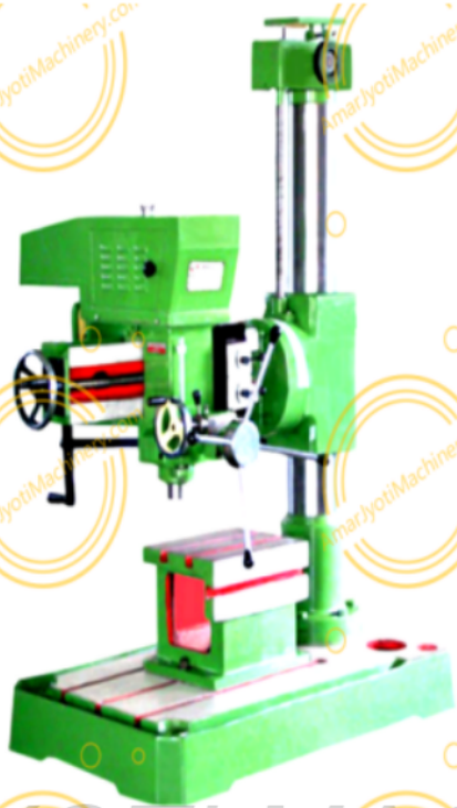
RADIAL MOTOR LIFT